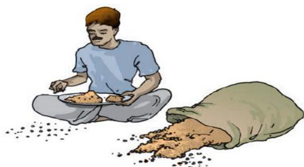
Fig. 5.3 Handpicking stones from grain