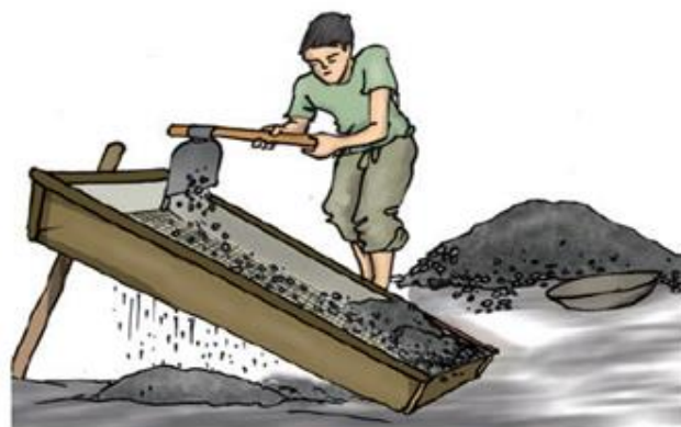
Fig. 5.7 Pebbles and stones are removed from sand by sieving