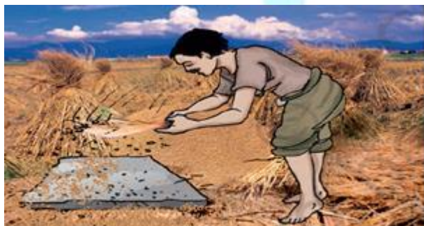
Fig. 5.4 Threshing