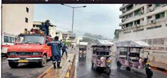
The State Disaster Executive Committee (DEC) under Disaster Management Act, 2005, can: